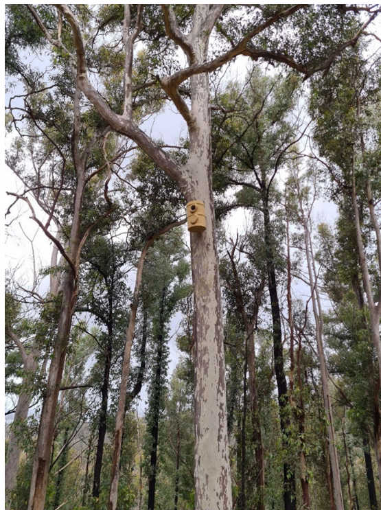
Habitech nest box installed as part of the habitat solution for this project