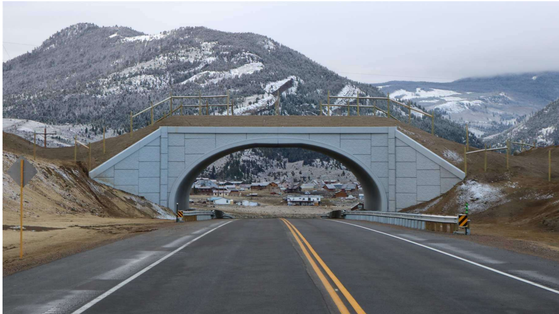
Wildlife overpass on Colorado State Highway 9

Read more at: https://www.pewtrusts.org/en/research-and-analysis/articles/2021/08/13/colorado-leads-states-in-protecting-wildlife-migration-corridors