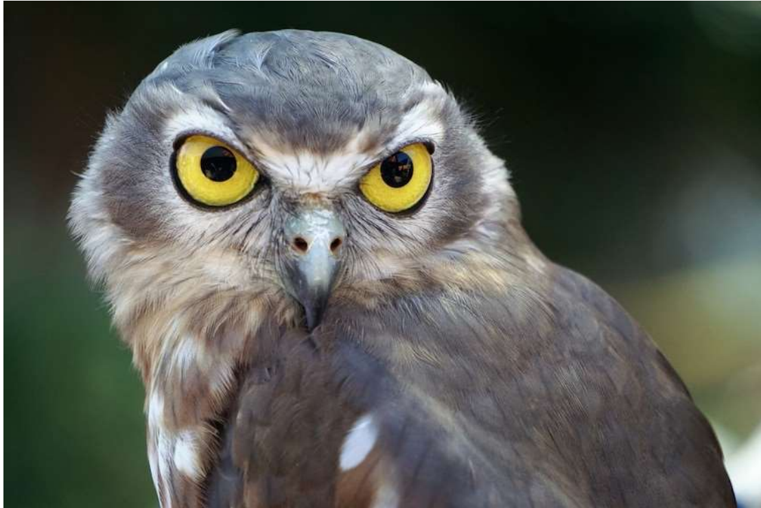
Barking owl

Read the full article about the research at https://www.abc.net.au/news/science/2021-08-15/on-the-hunt-for-the-barking-owl-recorders-headtorches-thermal/100348184