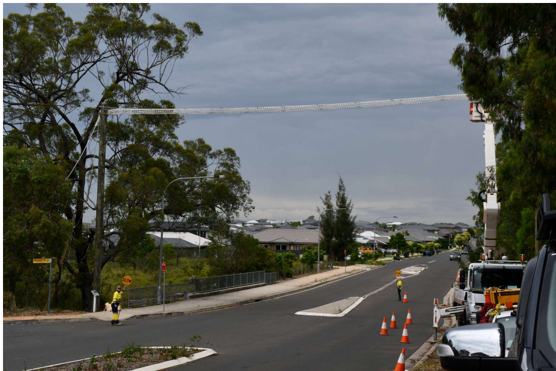
Wildlife ladder crossing erected in Glenmore Park