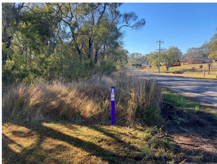
Roadside marker - Penrith LGA

Award winners will be announced at the on-line ceremony on 16 November. LGNSW will also host a Finalists Forum showcasing council environmental projects on 9 November. More details: https://www.lgnsw.org.au/Public/Members-Services/Environment-Awards/Excellence-in-the-Environment-Awards.aspx